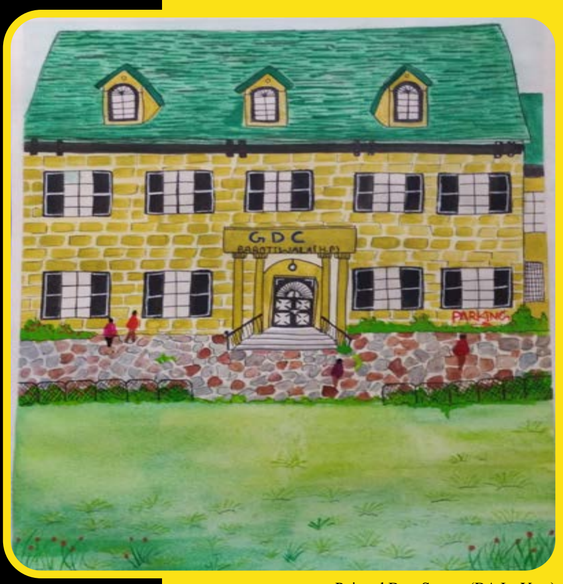
Painted By - Seema (BA Ist Year)

BIANNUAL E-NEWSLETTER VOL. 1(1) JUNE - DEC 2024