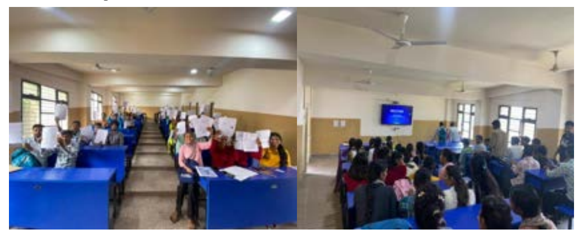
The club remains committed to fostering electoral awareness among students and preparing them to be responsible citizens of the country.

The Electoral Literacy Club of our college organized a Voter Awareness and Registration Drive on 13/11/2024 during the academic session 2024-25. This initiative aimed to educate students about the importance of their voting rights and encourage active participation in the democratic process.